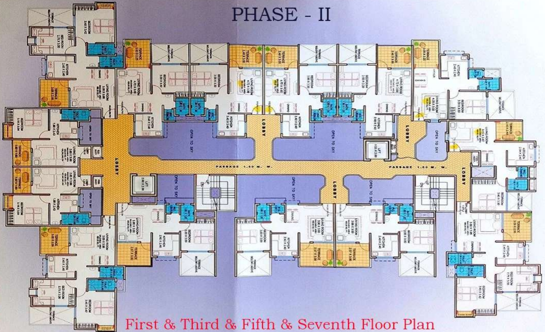
First & Third & Fifth & Seventh Floor Plan