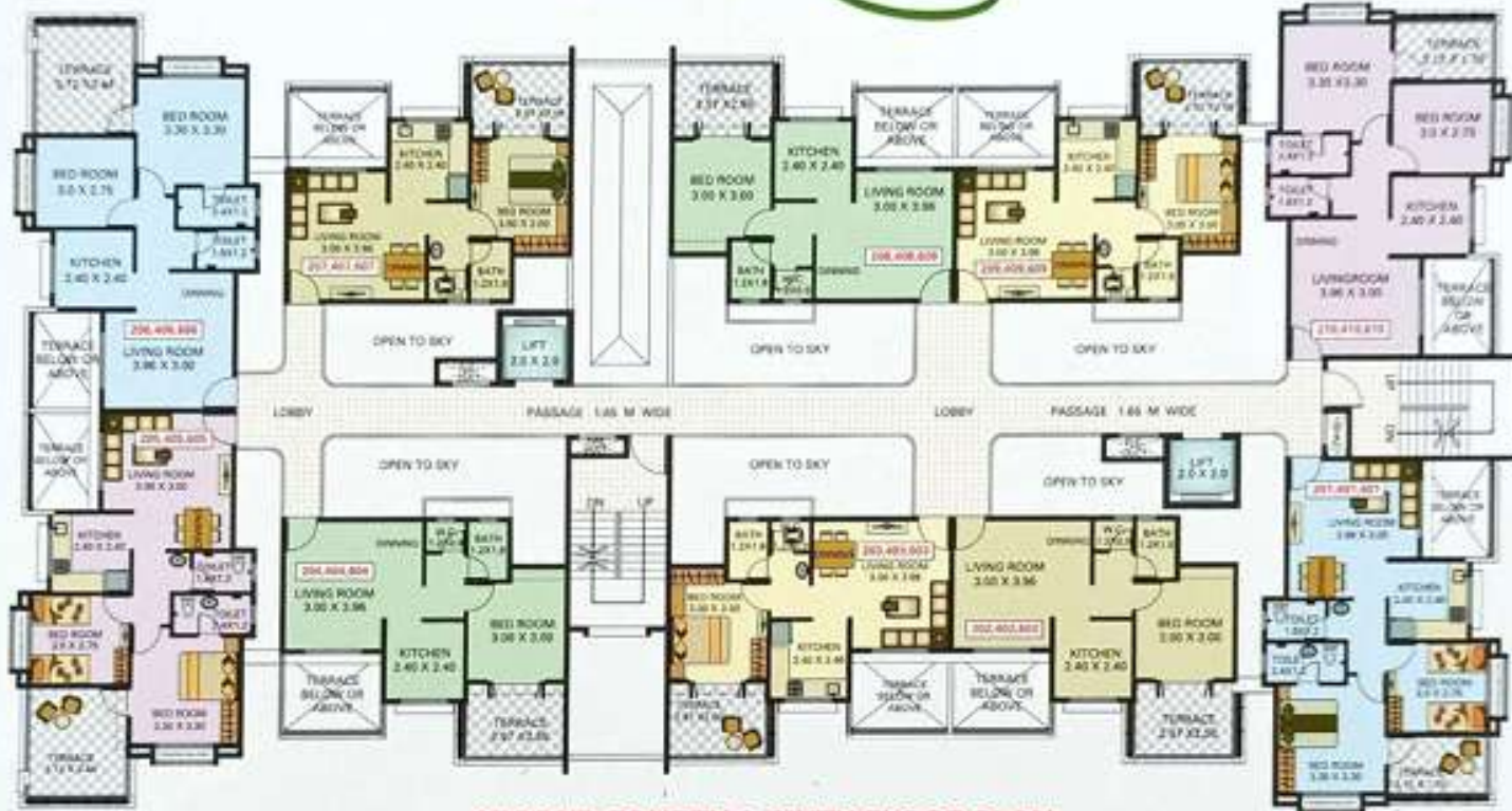
SECOND, FOURTH & SIXTH FLOOR PLAN