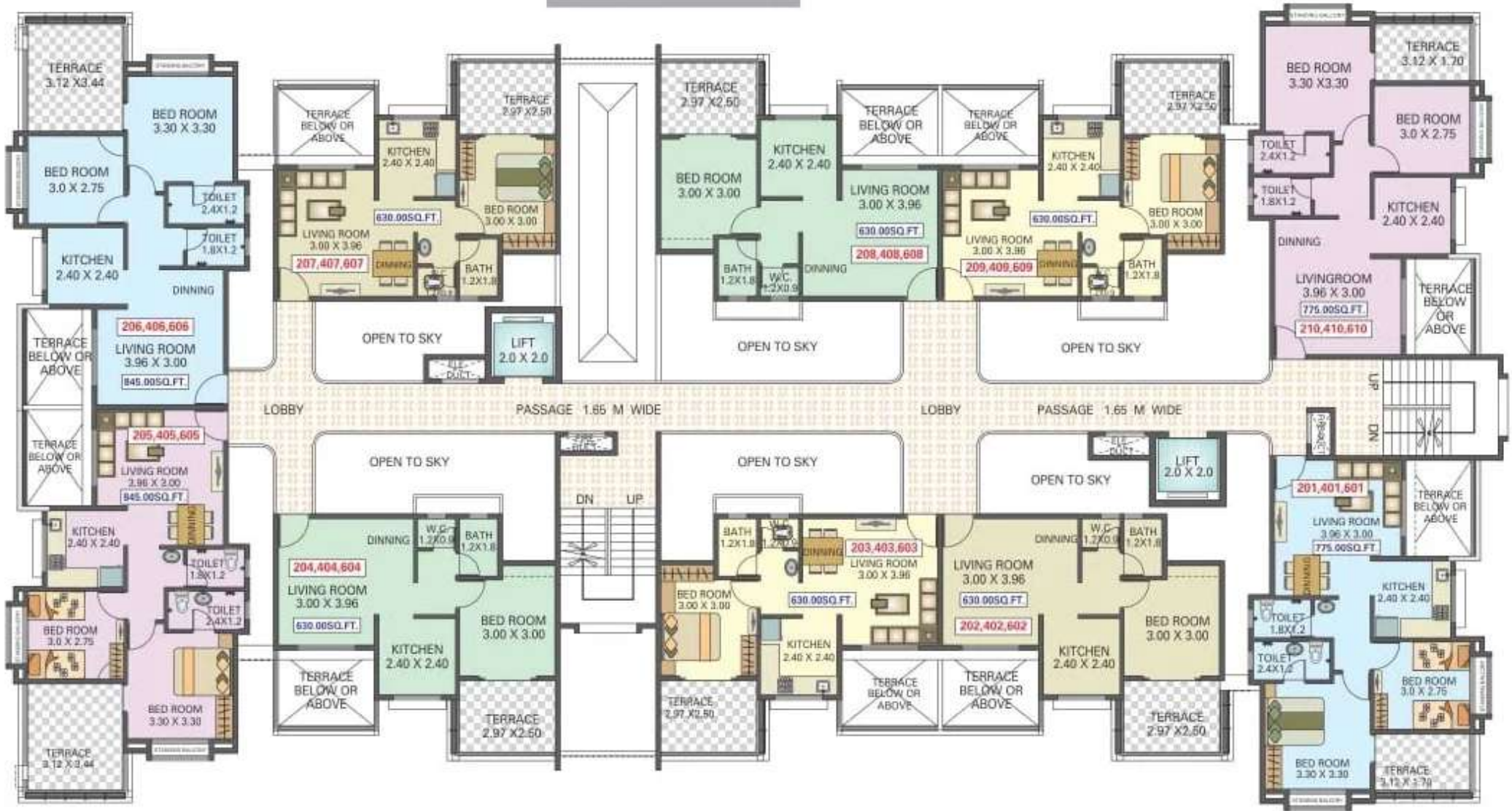
SECOND, FOURTH & SIXTH FLOOR PLAN