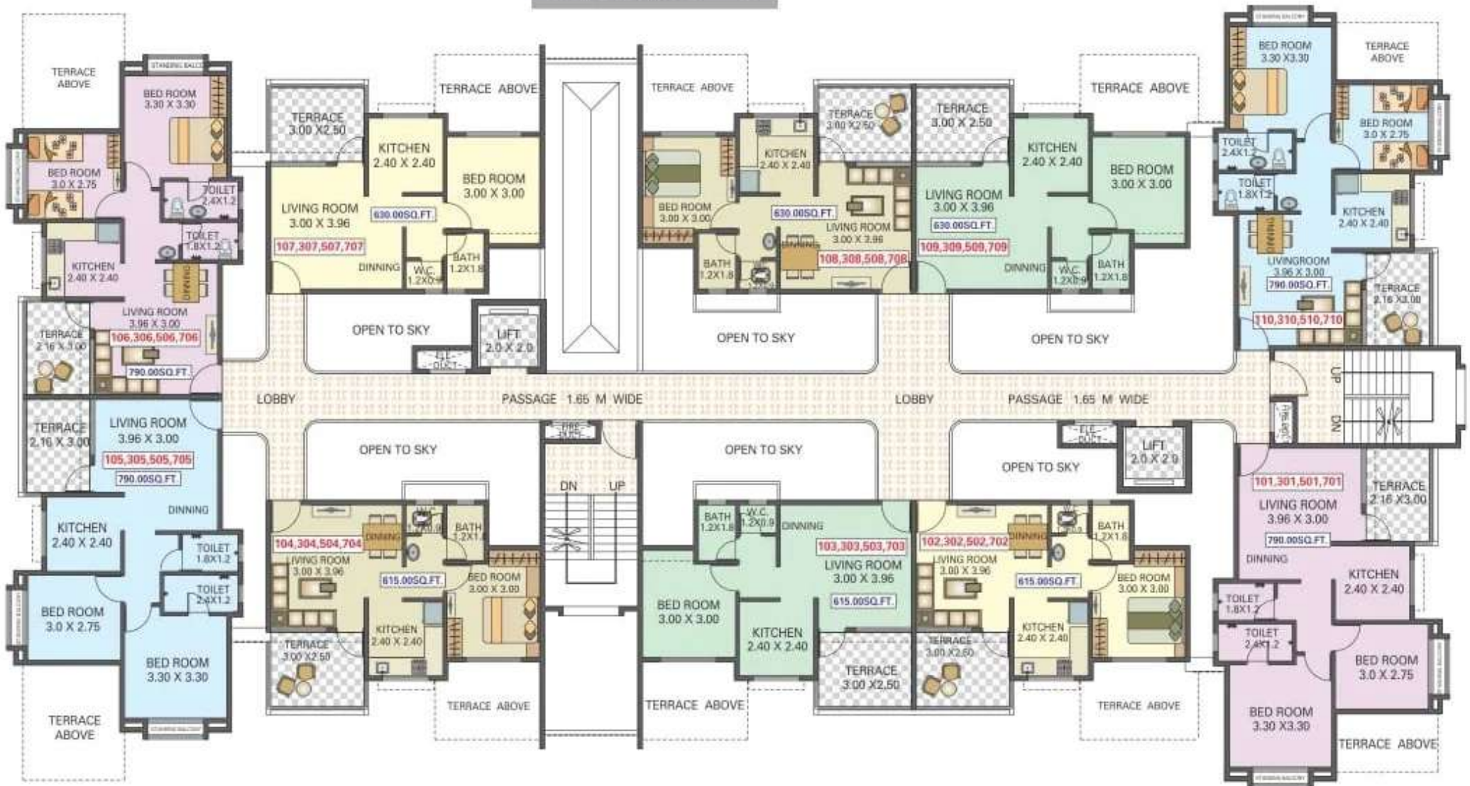
FIRST & THIRD & FIFTH & SEVENTH FLOOR PLAN